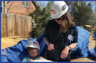
So kids know the importance of giving back