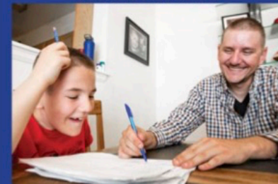
To put the home back in homework